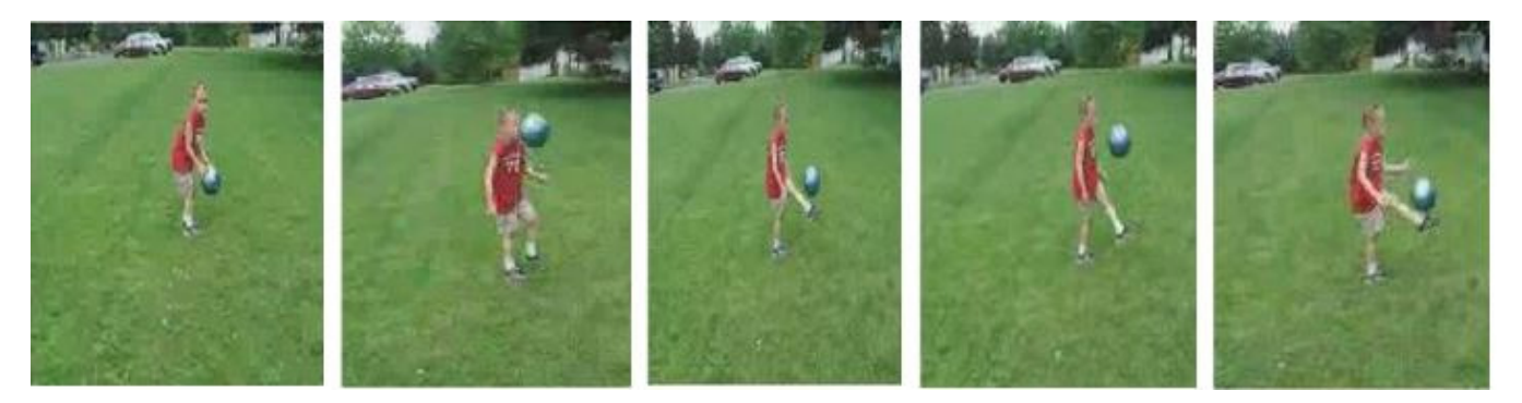
Fig. 1: The first 5 frames from a UCF YouTube video sample of juggling a soccer ball. Such soccer videos were from the 6th of 11 categories in the classification experiment. So the target output for this sampled video clip was the 1-in-K-coded bit vector [0\ 0\ 0\ 0\ 1\ 0\ 0\ 0\ 0] .