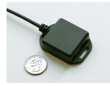
Figure 2. MotionNode sensing platform

Based on the above considerations, we use an off-the-shelf sensing platform called MotionNode to capture human activity signals and build our dataset. MotionNode is a 6-DOF inertial measurement unit (IMU) specifically designed for human motion sensing applications (see Figure 2) [2]. Each MotionNode itself is a multi-modal sensor that integrates a 3-axis accelerometer, 3-axis gyroscope, and a 3-axis magnetometer. The measurement range is \pm 6g and \pm 500dps for each axis of accelerometer and gyroscope respectively. Although body limbs and extremities can exhibit up to \pm 12g