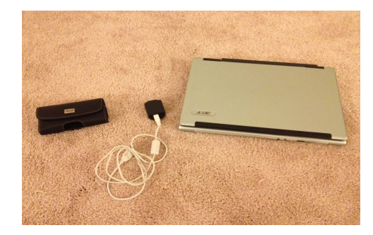
Figure 3. MotionNode, the mobile phone pouch, and the miniature laptop

Ground truth was annotated while the experiments were being carried out. When the subject was asked to perform a trial of one specific activity, an observer standing nearby marked the starting and ending points of the period of the