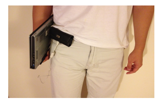
Figure 4. During data collection, a single MotionNode is packed firmly into a mobile phone pouch and attached to the subject's front right hip

activity performed. In addition, the observer was also responsible for recording the details of how subjects perform activities. Examples include how many strides the subject made during one trial of "walking forward"; how the subject climbed the stairs (one stair at a time, or two stairs at a time) during one trial of "walking up stairs", etc. This online ground truth annotation strategy eliminates the need for the subjects to annotate their data by themselves and helps to reduce annotation errors.